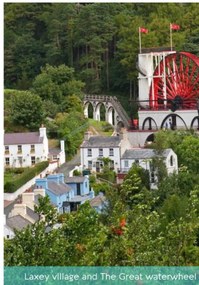
Laxey village and The Great waterwheel